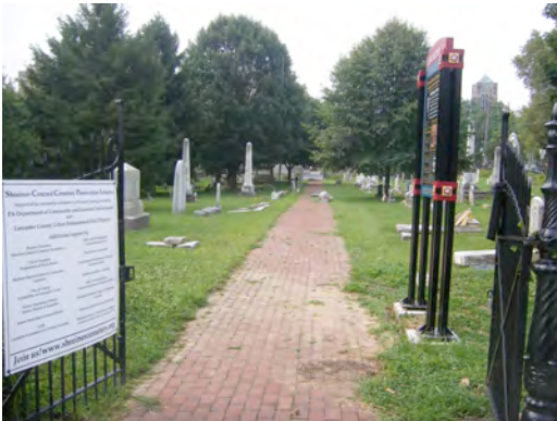
Figure 2. Main Entrance – W. Chestnut St

The artist has liberty to decide where exactly to place the installation. We imagine it could be placed along the main brick pathway for greater visibility and accessibility, but are open to other suggestions. Due to the open nature of this site and the difficulty of capturing it with photographs, the artist is required to make a site visit. All costs for this visit will need to come out of the overall budget.