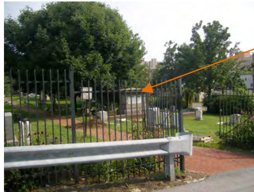
Thaddeus Stevens' grave